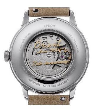
■ Case back with anniversary marks and engravings (RA-AK0808S)